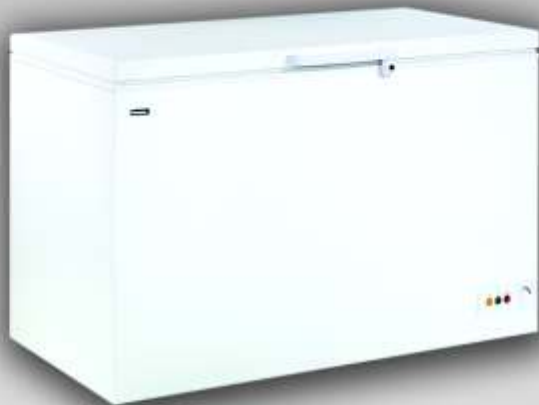
CL 400 PS