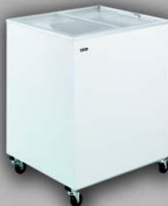
FR 200 PFF