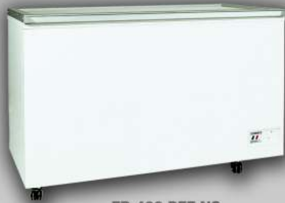
FR 400 PFF NS