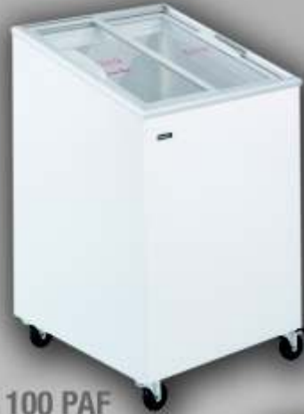
CL 100 PAF