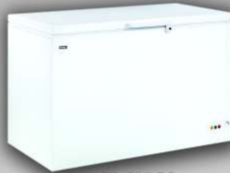
FR 400 PS