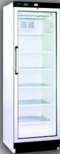
FR 370 VG