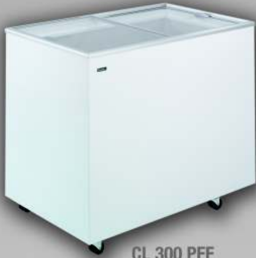
CL 300 PFF