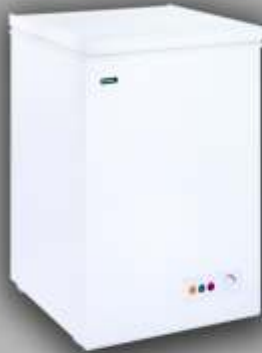
FR 100 PS