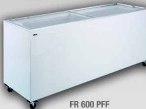
FR 600 PFF

CONGELATORI VETRO PIATTO-CHEST FREEZERS SLIDING GLASS LID