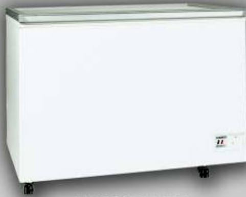
FR 300 PFF NS