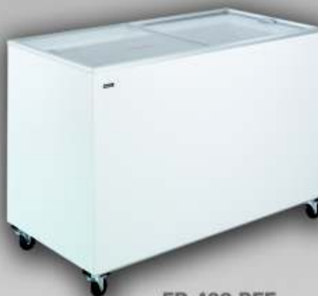
FR 400 PFF