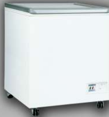
FR 200 PFF NS