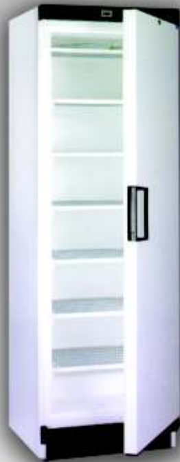
FR 370 VS

CONGELATORI VERTICALI • UPRIGHT FREEZERS