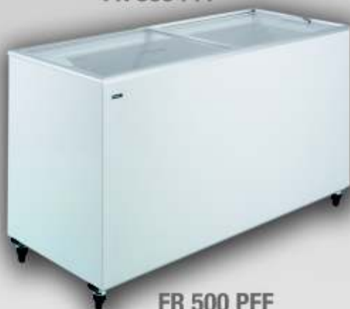
FR 500 PFF