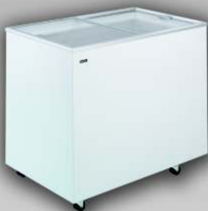
FR 300 PFF