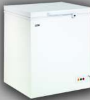
FR 200 PS