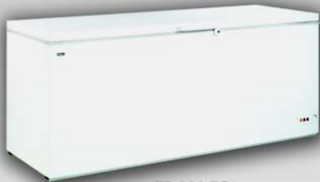
FR 600 PS