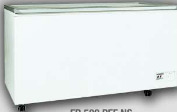
FR 500 PFF NS

CONGELATORI VETRO PIATTO FISSO • FREEZERS SEE-THRU L