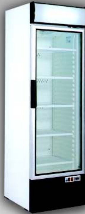
FR 378 VGC