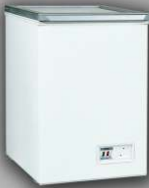
FR 100 PFF NS