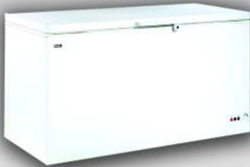
FR 500 PS