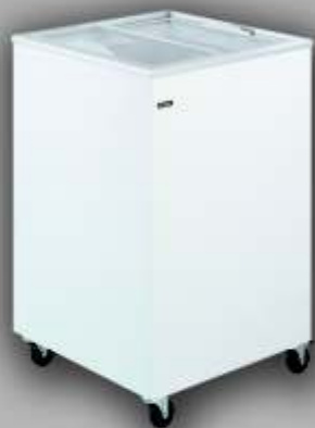
FR 100 PFF