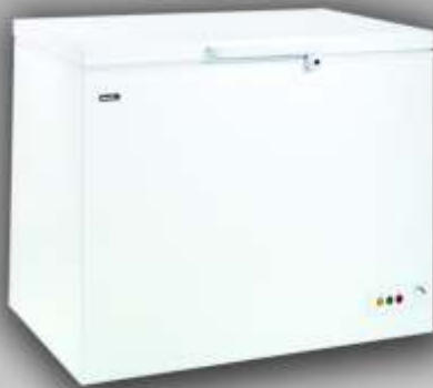
FR 300 PS